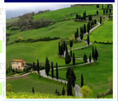
OOTY TEA GARDEN